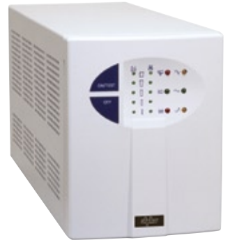
Tower 600 to 3000VA