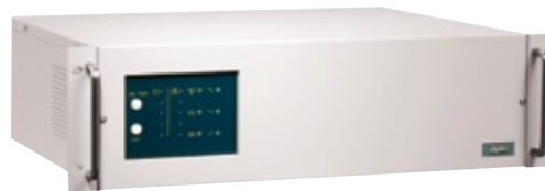
19" Rack Mount 800 to 2000VA

Line Interactive UPS Tower/19" Rack Mount Versions